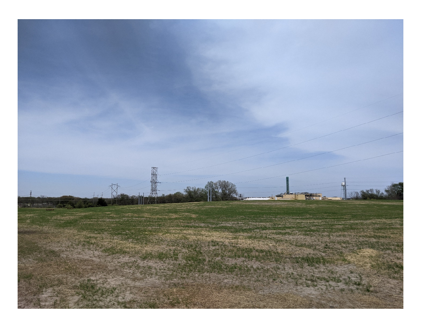
Looking northeast standing at the upstream end of Channel 1.