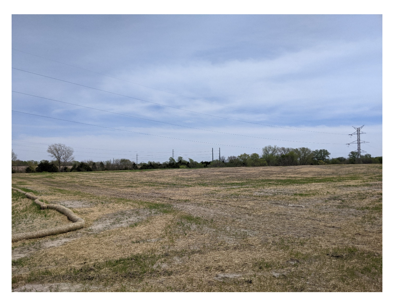
Looking southeast standing at upstream end of Channel 1.