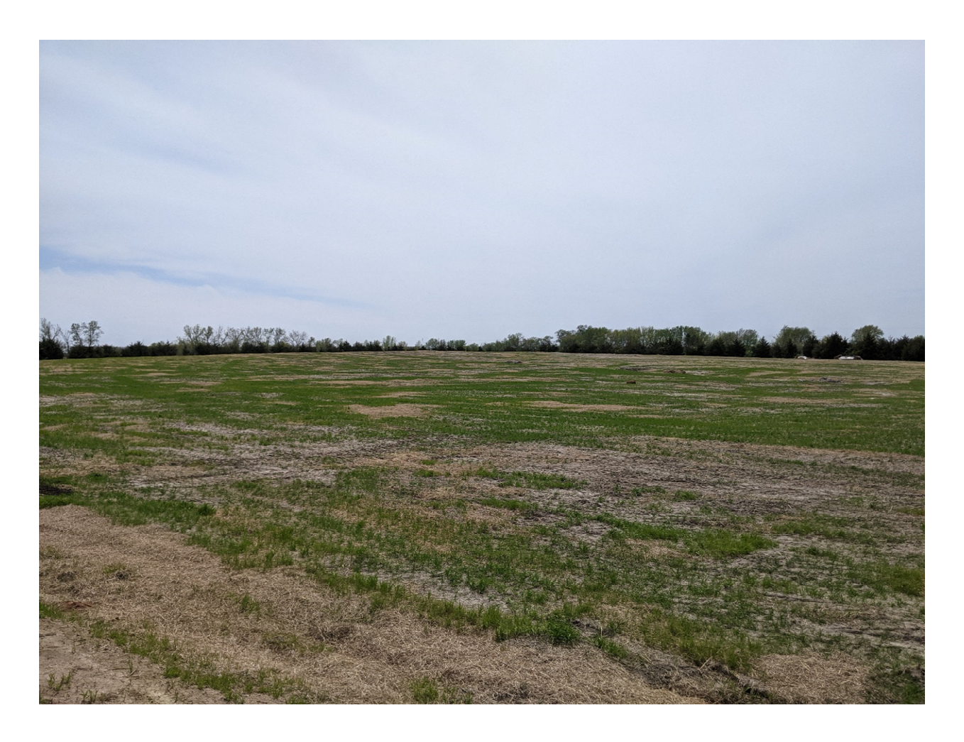
Looking south standing on Cell 2 in the northwest corner.